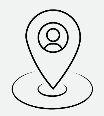
Geo-Location Sign-in: Enhance security by regulating sign-in locations.

Implement Multi-Factor Authentication (MFA) for Users, Administrators, and Guest accounts.