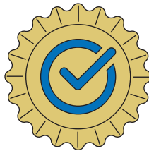
Compliance as a Service (CaaS)