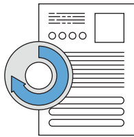
Patches, Updates, and Reporting