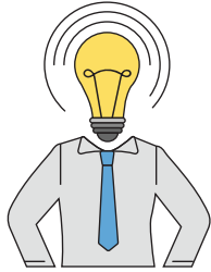
Dedicated and Passionate Apple Experts